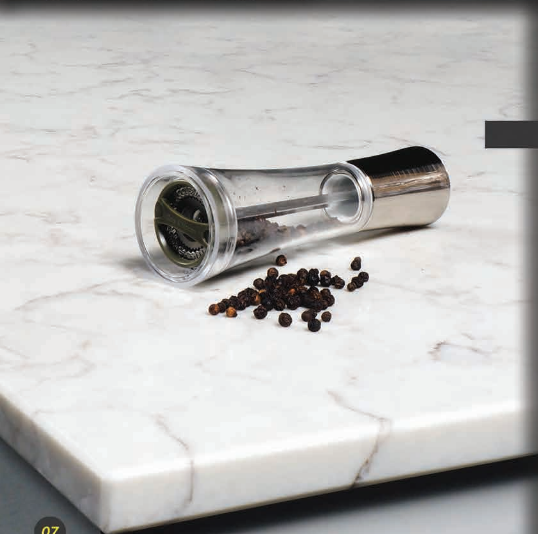
White Valley Esk